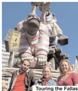
Touring the Fallas

Where : Cher's Karaoke Disco-Bar, Calle Huertas 50 (Metro: Anton Martin or Sevilla). To Sing : For those who would like to sing, because the bar gets packed by 23:15 h, you should arrive between 22.30 h and 23:30 h and sign up with the DJ. Special offer on