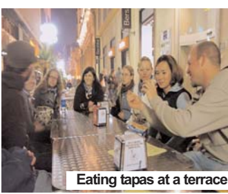
Eating tapas at a terrace