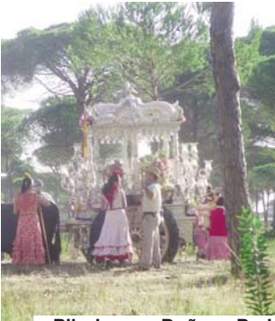
Pilgrimage, Doñana Park

Where: Metro: Sol. Terraza Café Monaguillo, Plaza Cruz Verde, 3. To get there from Plaza Mayor: Walk down C/ Toledo to Plaza Puerta Cerrada and then down C/ Segovia to Plaza Cruz Verde, which is on the right before you walk under the big Aqueduct bridge. Description: This beautifu of June, pub night will be taken outdoors (al aire libre) to a terrace, where all the students can speak English with the teachers, have a drink and enjoy themselves.