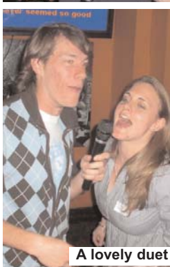
A lovely duet