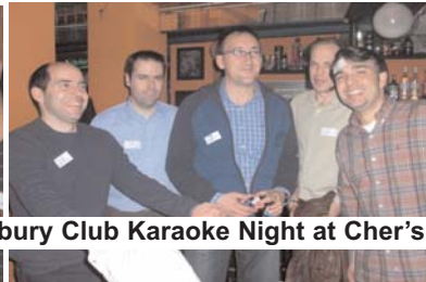
Teachers about to sing