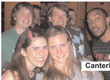
Canterbury Club Karaoke Night at Cher's