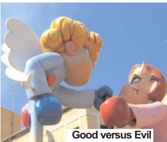
Good versus Evil