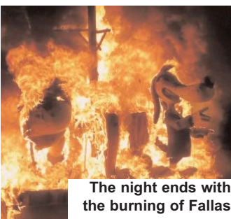
The night ends with the burning of Fallas