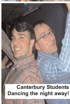
Canterbury Students Dancing the night away!